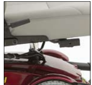
New swivel handle