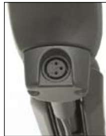
Charger port relocated under controller