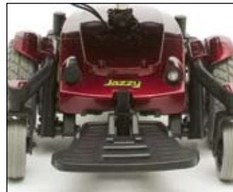
New redesigned foot platform