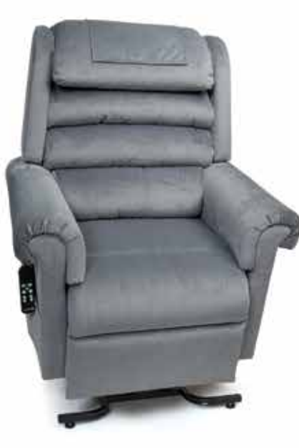
PR-756L shown in Sterling Available in Medium and Large

Experience the supportive comfort of 49 pocketed coil seat springs in the Cirrus. Each spring glides up or down independently to give your body unmatched seat support. The Cirrus is available in Medium which fits people 5'4" to 5'10".