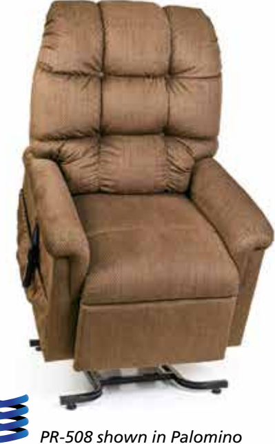
Available in Medium

The Cloud is now available in TWO sizes! The new Cloud PR510-SME is a small/medium sized chair designed to fit people 5'1" to 5'6". It features the same bucket seat and oversized, biscuit style backrest for the right amount of support. The original Cloud is recommended for people 5'7" to 6'4".