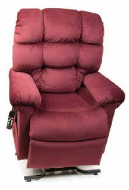
PR-510 shown in Shiraz Available in Small/Medium and Medium/Large

The Cloud is now available in TWO sizes! The new Cloud PR510-SME is a small/medium sized chair designed to fit people 5'1" to 5'6". It features the same bucket seat and oversized, biscuit style backrest for the right amount of support. The original Cloud is recommended for people 5'7" to 6'4".