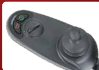
PG GC3 Controller

Style and performance meet perfect portability. The Jazzy® Elite ES Portable easily disassembles for transport and features large, front wheels to absorb everyday obstacles. An intuitive hand control and a comfortable, high-back seat add to the sophisticated appeal.