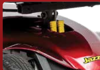
Easy-access freewheel levers