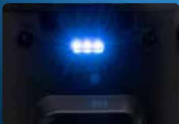
Under-tiller puddle light