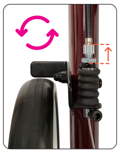
Tighten the Brake