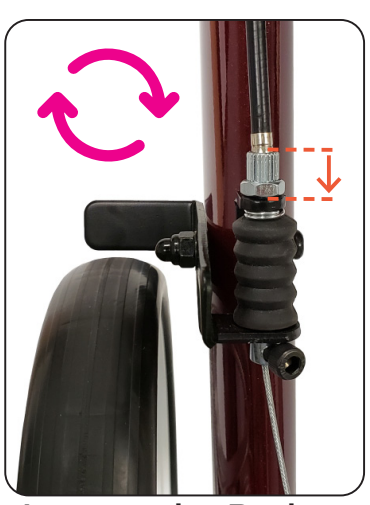
Loosen the Brake